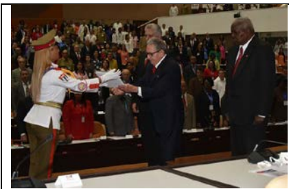
During the Second Extraordinary Session of the National Assembly's Ninth Legislature, Army General Raúl Castro Ruz, Party first secretary, formally accepted the new Constitution of the Republic, which now governs the country's legal system.

The measures adopted included the establishment of a minimum monthly wage of 400 CUP in the budgeted sector, with other increases providing an average monthly wage of 1,067 CUP.