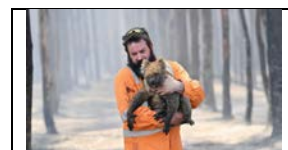
Australia's forest fires have killed millions of animals and destroyed ecosystems.

In another message Díaz-Canel stated: "While all living species are fleeing in horror from the hell of Australia's forests, the empire is fanning a terrible fire, putting the world on the brink of war. Fidel Castro asked, more than 40 years ago: What is the United Nations for? Today an answer is urgently needed."