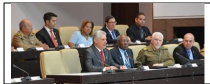
The Cuban people voted for coherent continuity of the Revolution, another victory for the man who occupied the first seat on the Assembly tribunal, to the right of Díaz-Canel, since its founding: Fidel.

“I assume this responsibility with the conviction that all we revolutionaries, from any trench, will be faithful to Fidel and Raúl, the current leader of the revolutionary process,” Díaz-